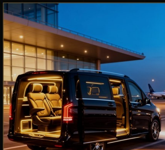
Mercedes Classe V